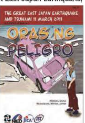
Cartoon prepared to disseminate their tsunami experience